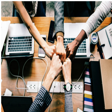
CLIENT & BROKER RELATIONS