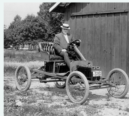
Henry Ford's experimental electric car c. 1914

Beyond this, breakdown – leading to battery fire or even bodily injury – as a result of electronic failure of the battery management system is also a concern. The first electric vehicle to