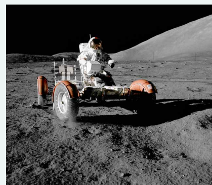
Apollo 17 battery electric powered Lunar Rover, 1972

catch fire from a faulty battery was in 2013 when a Tesla driver accidentally ran over a piece of metal that punctured the quarter-inch thick armored undercarriage of the vehicle and penetrated its battery pack 6 . Within 30 minutes, the car was in flames. Battery technology has improved since then, but issues remain.