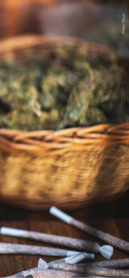
Legalization of cannabis has become a hot topic for insurers

we review each account and challenge many customers. However, it is necessary after many years in a soft cycle.