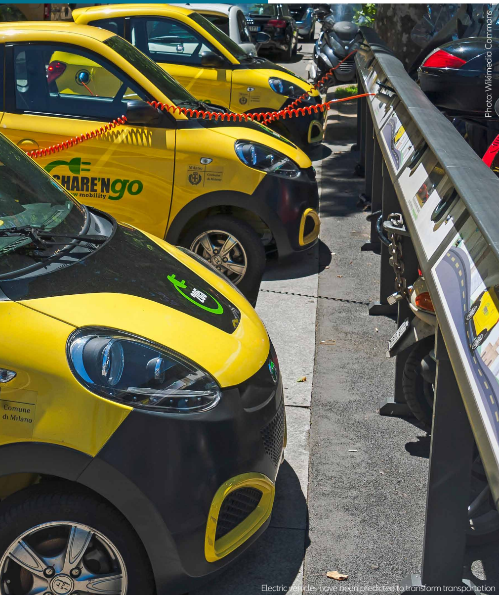
Electric vehicles have been predicted to transform transportation