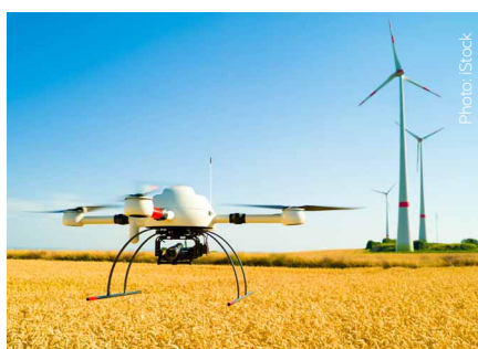
Drone surveys is one of the services on offer