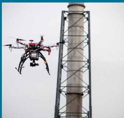
On-demand drone cover is now available

“The drone industry is on the cusp of a transformative development, with the development of electric unmanned aircraft that are able to fly beyond