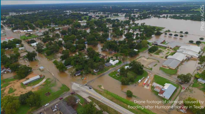
Drone footage of damage caused by flooding after Hurricane Harvey in Texas