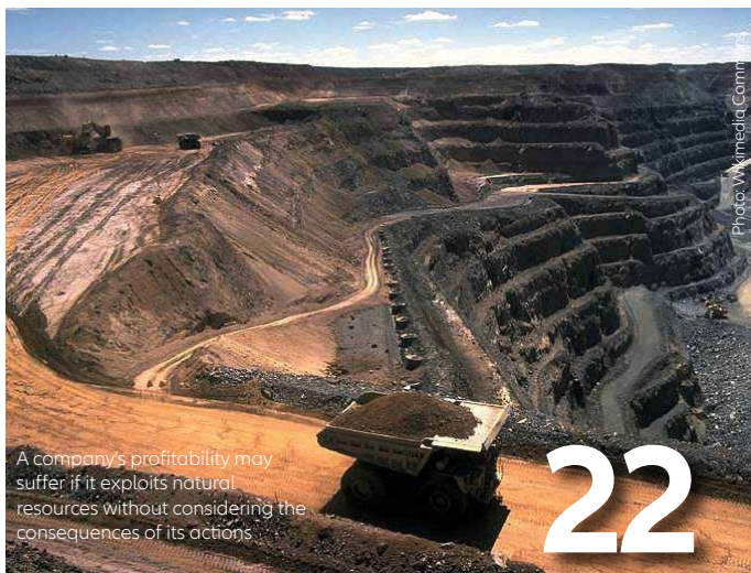
A company's profitability may suffer if it exploits natural resources without considering the consequences of its actions.