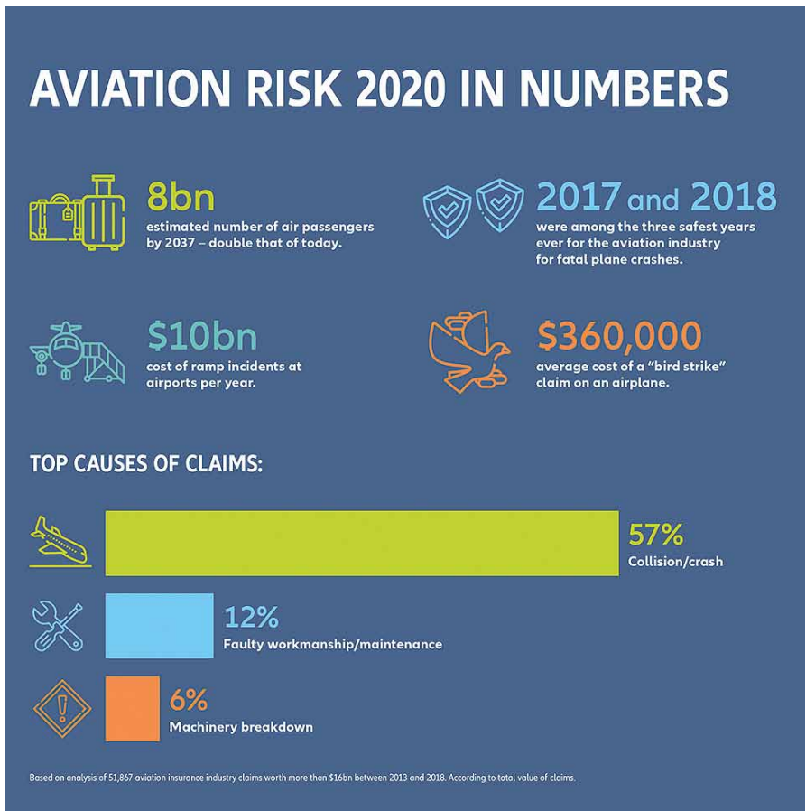
Faulty workmanship/maintenance is the second major cause of aviation insurance claims

The growing complexity of aircraft design, technology and manufacturing is also leading to more costly grounding incidents, involving entire fleets, as in the case of the aftermath