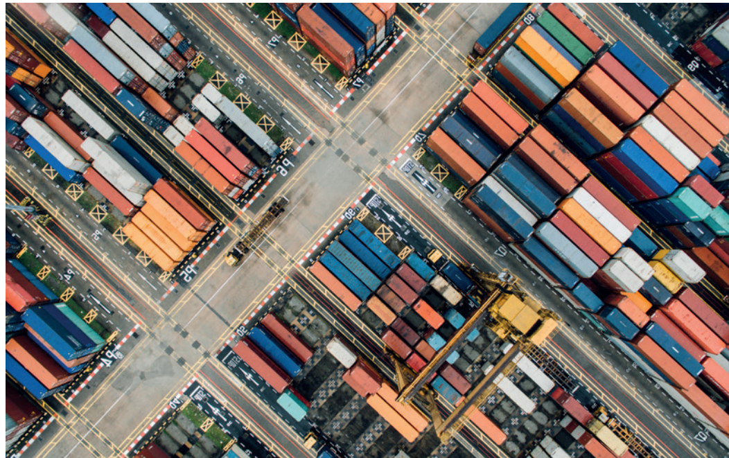
Keep loaded trailers in a secure area that is well lit and actively monitored to prevent unauthorised access