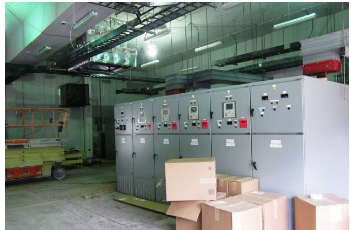
When hot-testing equipment, always have a written commissioning plan

PROTECTING EQUIPMENT IN SUB-CONTRACTOR CARE Note that it is important for the contractor to ensure proper handling and care of equipment by the subcontractor. Often contractors do not consider the protection of equipment while offsite and in the subcontractor's possession a project exposure, however, this is often an incorrect assumption. Many losses to contractor equipment occur while in the custody of the subcontractor or stored offsite. With long-lead equipment, such losses can delay project completion, resulting in a costly loss and owner dissatisfaction.