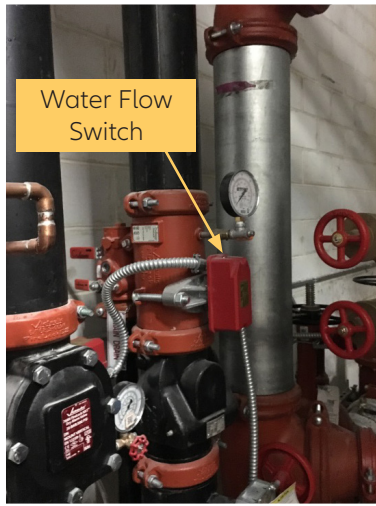
Water Flow Switch