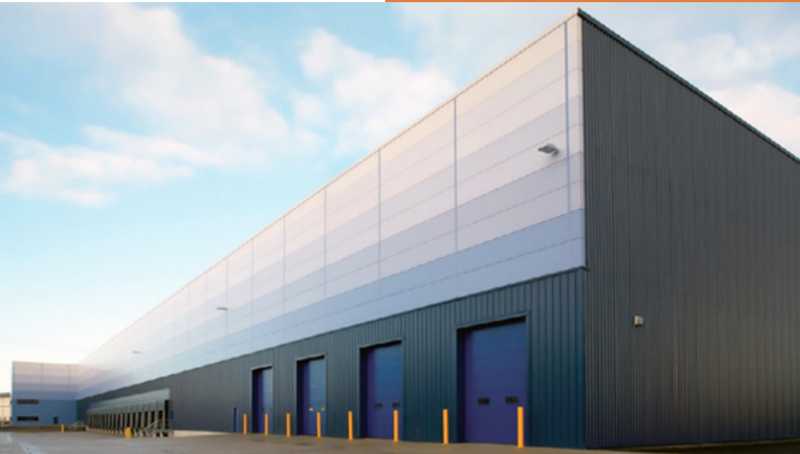
Building with Insulated Metal Sandwich Panel Walls

This Tech Talk discusses types of sandwich panels, potential fire hazards and Allianz Risk Consulting (ARC) recommendations for new and existing installations.