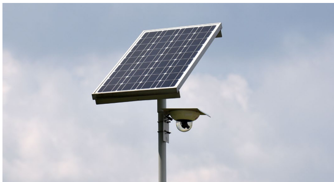
Solar Powered CCTV –especially useful where supplied power is unavailable