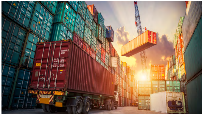
Cargo theft incidents North America, 2022.